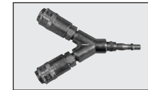
AC6103 Y Twin Coupling Set 23.90