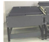
Extension Sheet Support (optional)