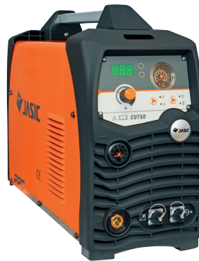
Jasic Plasma Cut 60