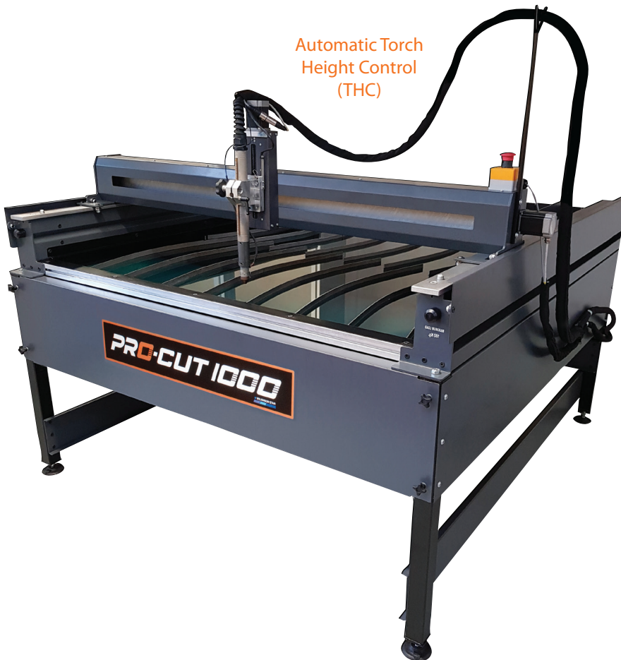
Automatic Torch Height Control (THC)

Our Torch Height Control system adjusts the torch height thousands of times per second to maintain a precise distance between the plasma torch tip and material being cut, ensuring on thinner material which are warped you will still experience smooth edges, sharp detail and precision cuts.