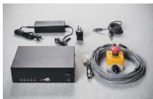
Electronic Control Unit and Cables