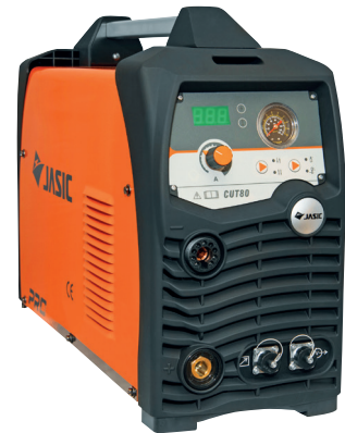
Jasic Plasma Cut 80