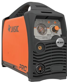
Jasic Plasma Cut 45

For optimum cutting performance, we have partnered the Pro-Cut Table with the Jasic Inverter Plasma Cutting Machines. We offer a choice of 3 Jasic Plasma cutters with a table cutting capacity of up to 20mm to ensure you get the right Plasma machine to suit your needs. With proven reliability, performance and backed up by a 5 year warranty we guarantee peace of mind cutting.